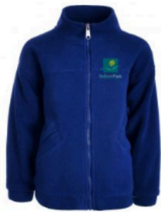
Polar Fleece Jacket Ballam Park PS (Emb)