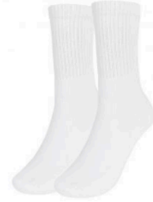
Cushion Foot Sports Socks - 3 Pack Unbadged