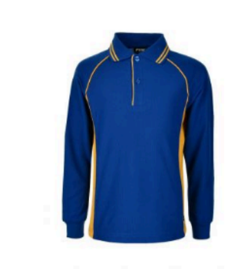
L/S Polo Shirt with Piping EMB- Ballam Park PS Vic