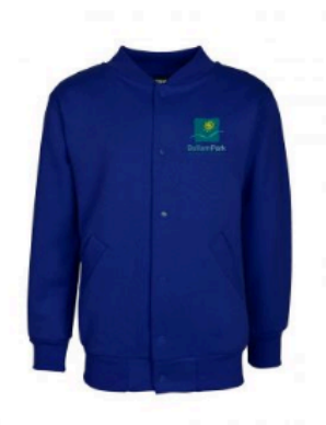
Bomber Jacket Ballam Park PS (Emb)