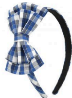
Hair Band with Bow Unbadged