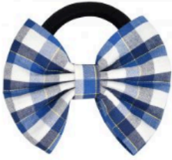
Hair Bow on Elastic - Pair Unbadged