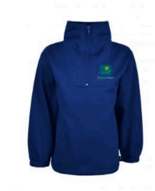
Zip Yoke Windcheater Ballam Park PS (Emb)