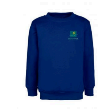
Crew Neck Windcheater Ballam Park PS (Emb)