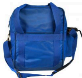
Backpack with Padding Unbadged