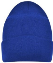
Rib Knit Beanie Hat Emb - Ballam Park PS Vic