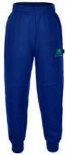
Trackpants - Double Knee - Rib Cuff Sml Prt - Ballam Park PS (Print)