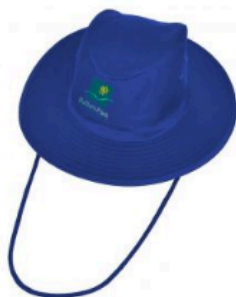
Safety Slouch Hat Hat Emb - Ballam Park PS Vic