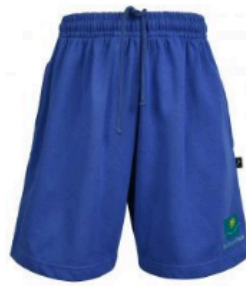
Rugby Shorts - Drawstring Ballam Park PS (Emb)