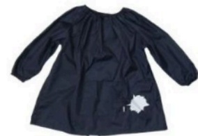
Artsmock with Print Unbadged