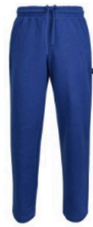
Trackpants - Straight Leg Unbadged