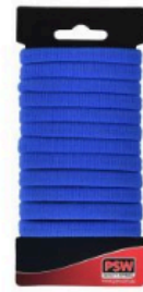
Coloured Hair Elastics - 12 pack Unbadged