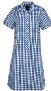
Semi Fit Darted Dress Unbadged