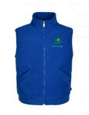
Polar Fleece Vest Ballam Park PS (Emb)