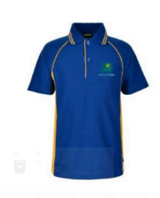
S/S Polo Shirt with Piping Sml Emb - Ballam Park PS