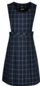
Box Pleat Tunic Unbadged